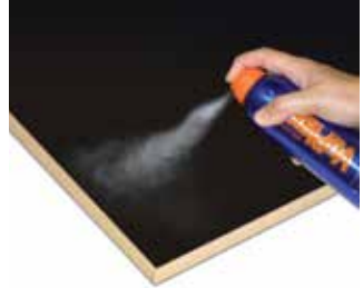
SPRAY PLASTIC POLISH